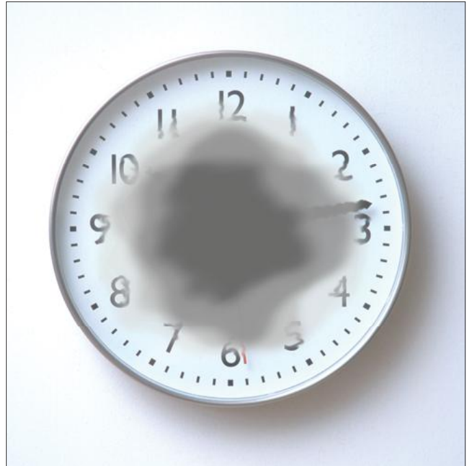
With AMD, dark areas may appear in your central vision.

A person with AMD loses the ability to perceive fine details both up close and at a distance. This loss of detailed vision affects only your central vision. The side, or peripheral, vision usually remains normal. For example, when people with AMD look at a clock, they can see the clock’s outline but cannot tell what time it is.